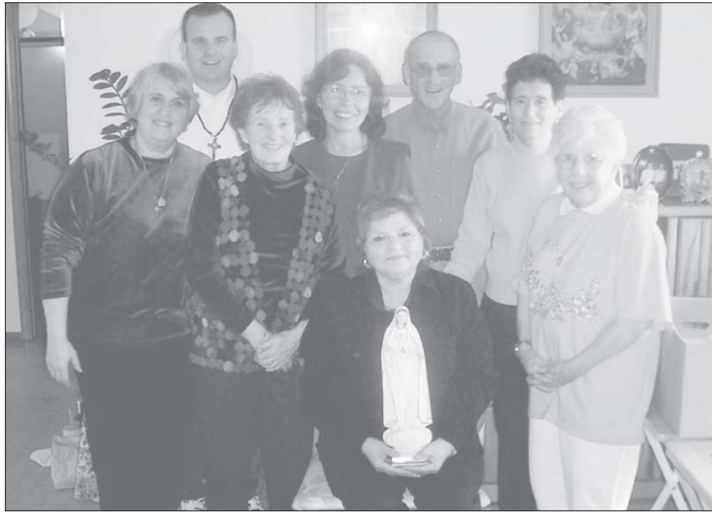
Trustee Meeting, Prescott Valley